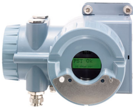
LCP960 Local Control Panel for PST